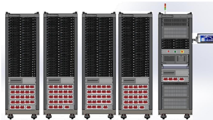
ITECH ITS5300-200 battery cell test system

ITECH ITS5300 battery charge and discharge test system can be well applied to