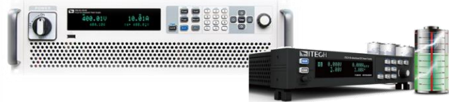
IT-M3600 regenerative power system